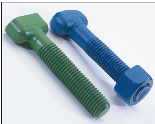
Xylan offers fasteners such as T-Bolts controlled torque, corrosion resistance and color-coding.

Xylan coatings solve as many problems for the oil industry as they do for waterworks.