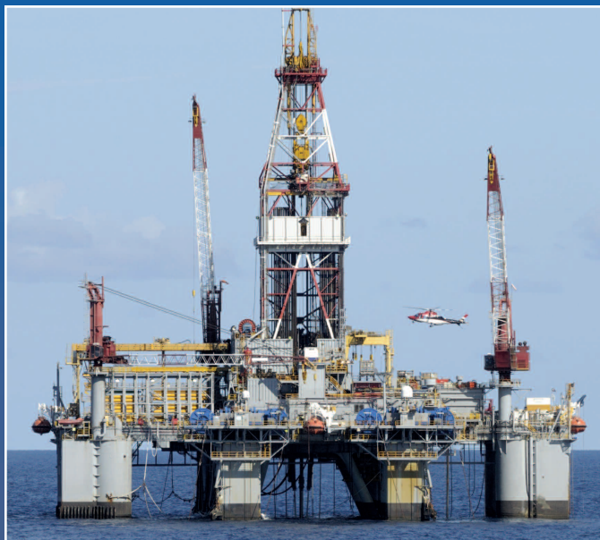
Xylan offers multiple benefits for oil rigs...