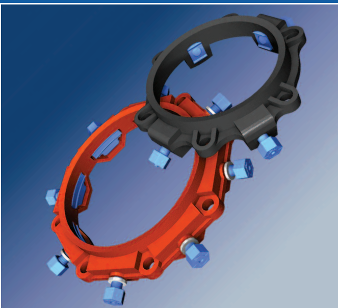
Provides controlled friction and corrosion resistance...