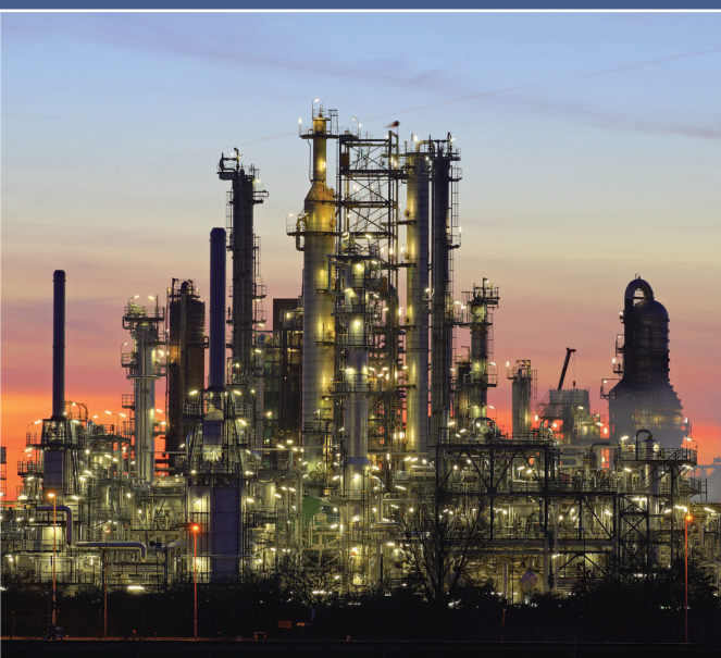
Solves many problems at chemical processing plants...