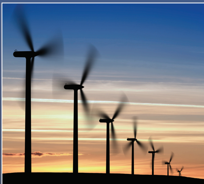
Xylan keeps wind farms running smoothly...